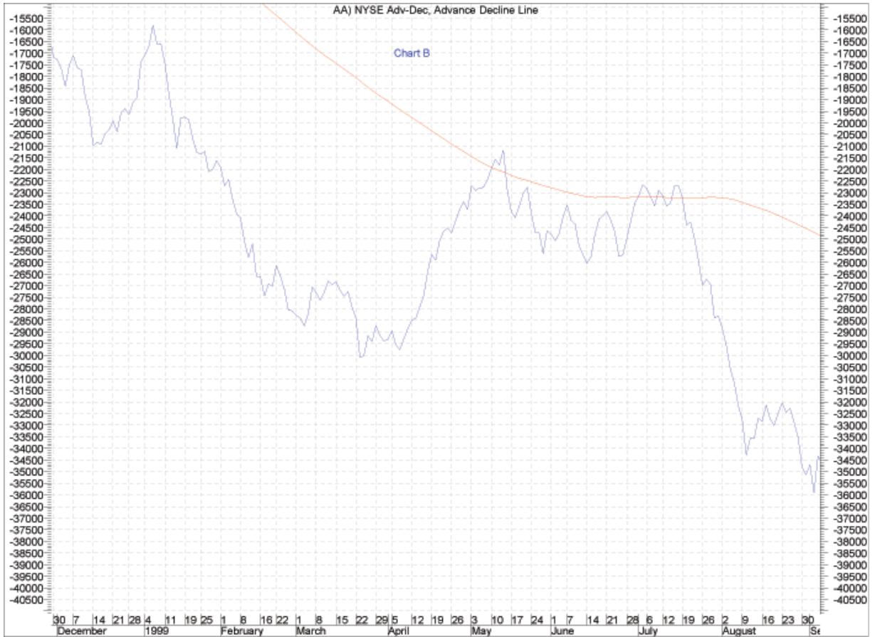
Created in MetaStock from Equis International